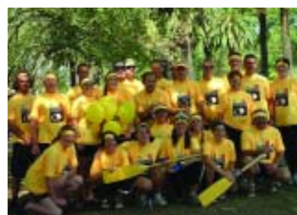
DRAGON BOAT RACING FOR THE CAMPAIGN IN AUSTRALIA