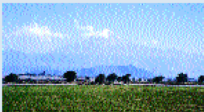
POPOCATEPETL VOLCANO, MEXICO

The conference will take place in the Hotel Fiestaamericana Reforma, conveniently located on the finest, most cosmopolitan avenue in Mexico City, the Paseo de la Reforma, a short walk from the historical centre. Mexico City airport is a 30-minute taxi journey away.