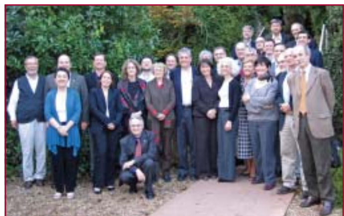
ILAE Commission Chairs

annual dues of each Chapter to ILAE are a minimum of $10 per year per Chapter, except for countries with low GDPs (World Bank categories low and lower middle) for whom membership is supported by a solidarity fund.