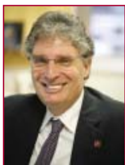
S Moshé President, ILAE

The first goal of our new Strategic Plan is: the ILAE shall serve all health professionals as the premier international resource for current and emerging knowledge on epilepsy prevention, diagnosis, treatment and research. To achieve this central goal we have drawn upon our international pool of talented members, chapter leaders, and regional representatives to address the challenges and opportunities that people with epilepsy are facing.