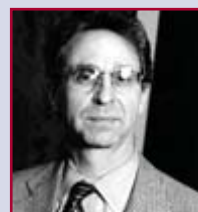
Epilepsia Editor-in-Chief Phil Schwartzkroin